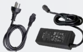
Power Adapter for Portable Repeater PS7502