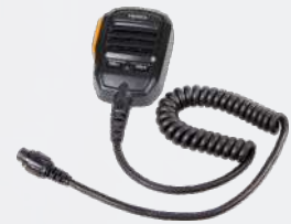
Waterproof Remote Speaker Microphone ( IP67 ) SM18A1

Optional antenna designed by Hytera is highly recommended. *Outdoor use of RD96X with antenna should avoid thunderstorms.