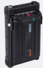
Power Management System PV3001