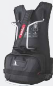
Nylon Backpack (for portable repeater only)(black) NCN010