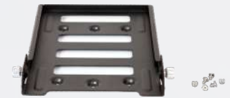
Multi-Functional Installation Bracket BRK17

Optional antenna designed by Hytera is highly recommended. *Outdoor use of RD96X with antenna should avoid thunderstorms.